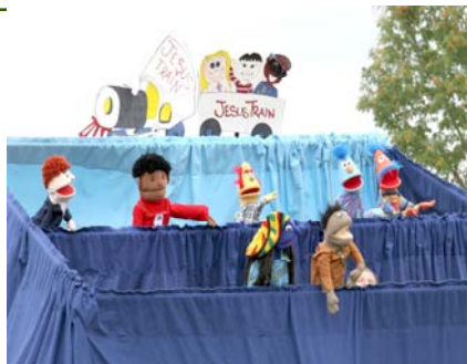
Sunset Forest Children performing Puppets of Praise!