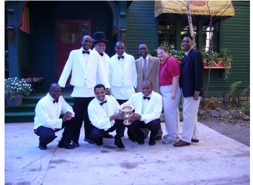
“Woods staff proudly accepts award!”

“Sunset Forest Association Awards Woods Restaurant, Best Restaurant on Mackinac Island!”